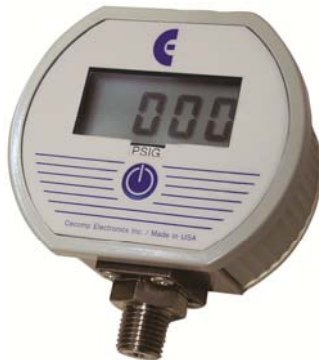
DPG 2000 B

Solution: The customer purchased an DPG2000B5000PSIG-5-HA. The DPG2000B has an accuracy of 0.1% with the HA option, intrinsically safe, and is very rugged so calibration will typically not be affected by field conditions.